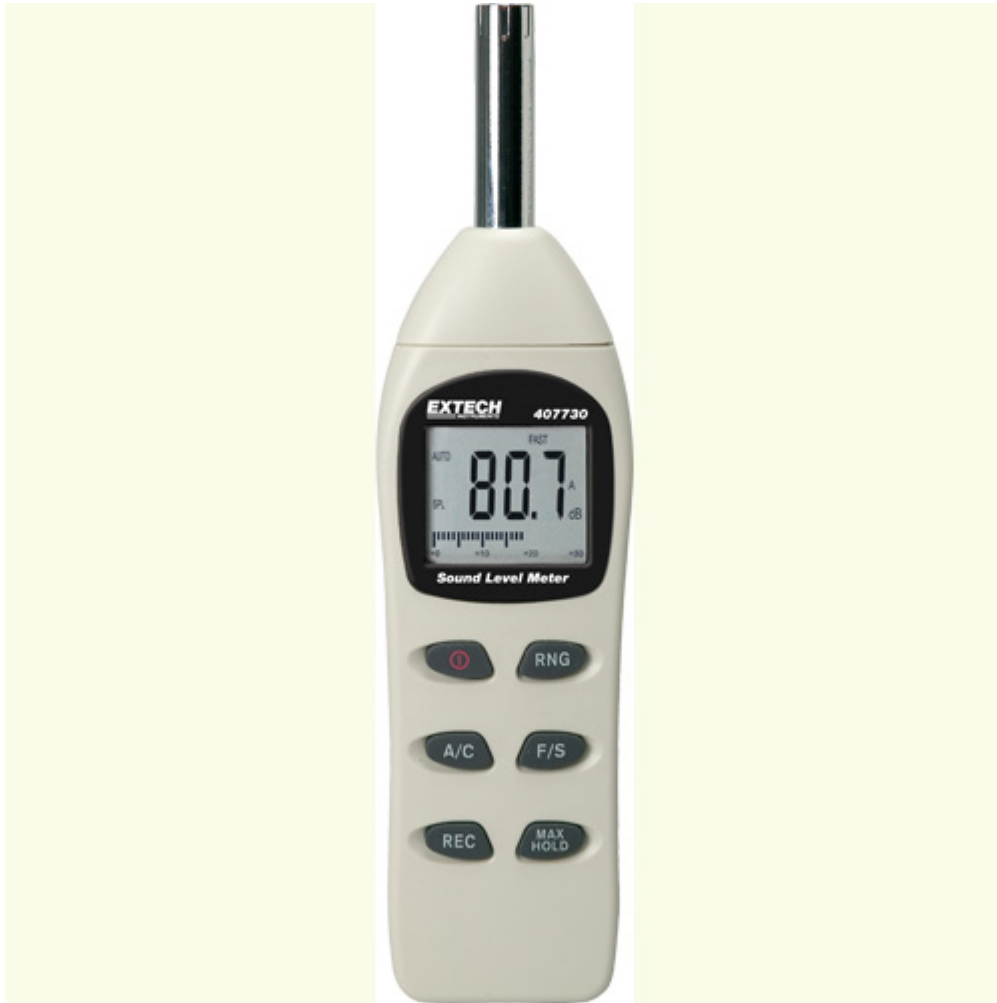
Extech Digital Sound Level Meter – 407730